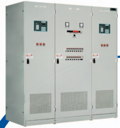
System configuration example