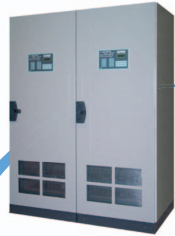
System configuration example